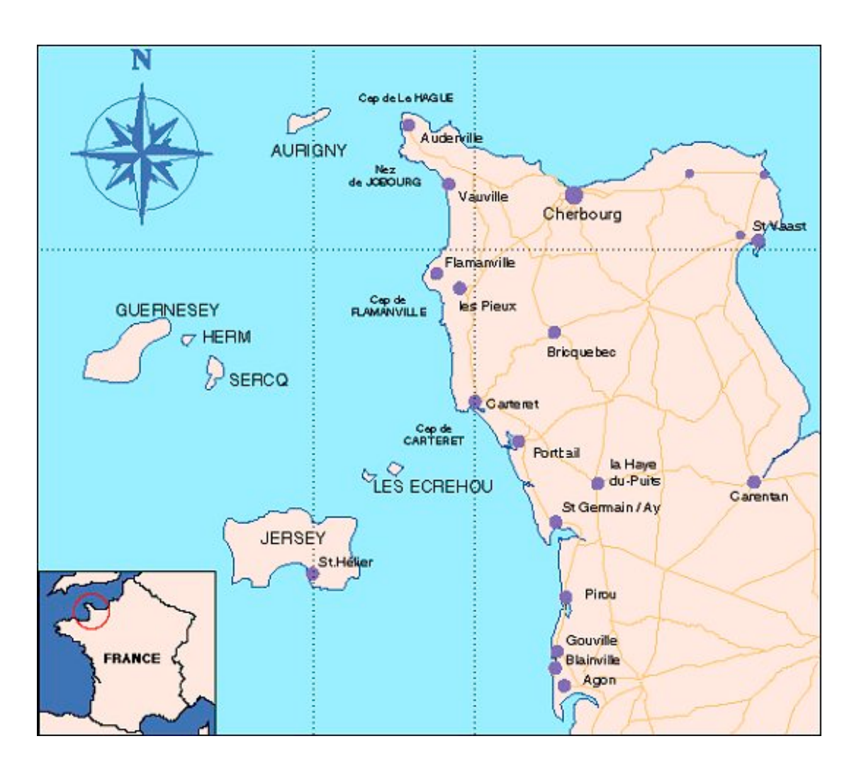
Figure 1 – Map of Jersey and the Channel Islands (reproduced from http://www.english-experience.com/)

Jersey is particularly frustrating. It is a Crown Dependency with a strong sense of its own distinctiveness. It has often behaved as if it were independent, and continues to do so. (Le Rendu, 2004: 10)