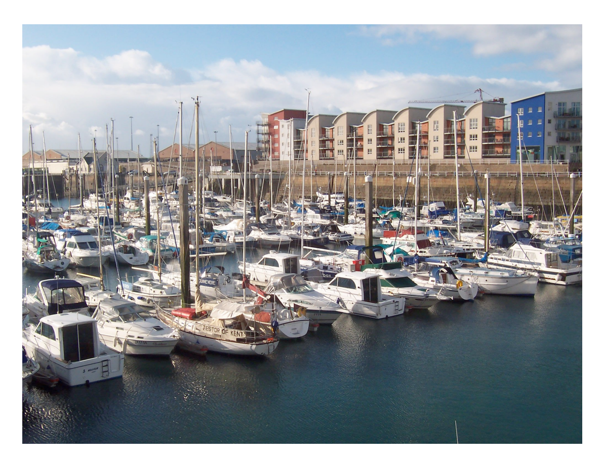
Figure 7 – Jersey's Waterfront

[Part of Jersey's Waterfront development, with the recently constructed residential project behind the marina. The proposed 20 storey high-rise development would stand alongside these apartments.]