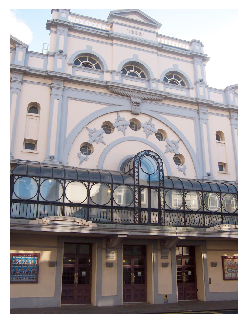
Figure 2 -The front façade of the Jersey Opera House

Jersey has a rich cultural scene, being well-served by a number of arts and cultural associations. The Jersey Arts Centre provides a theatre space, a gallery and workshop rooms. The Jersey Opera House, meanwhile, provides another theatrical space and is used by larger scale local and touring productions. There are also a number of local amateur theatre companies, orchestras and dance schools as well as professional artists working in the Island. It is estimated that there are 46 bodies dedicated to 'cultural activity' in Jersey, with between one in six and one in ten of the population actively involved in the arts (Burns and Middleton, 2000: 52). Jersey's heritage is also well represented, with the Jersey Heritage Trust, the Société Jersiaise and the National Trust for Jersey looking after historically and ecologically important sites. A summary of Jersey's principal cultural organisations and their objectives can be found in Appendix 1.