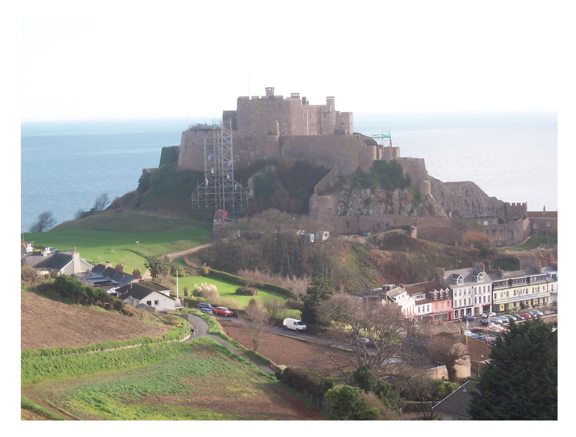
Figure 6 - 13<sup>th</sup> century Mont Orgueil Castle, originally built to protect the island against the French, with the Normandy coastline on the horizon

The increased penetration of media and information channels into the Island has brought with it an emphasis on the creative industries and popular culture. A report published by the Jersey Arts Trust states that the creative industries have 'the potential to make a significant contribution to the economy' (Feltham, 2004: 12). Encouraging growth of the creative industries will certainly diversify the economy, but it will also open the Island up to a further influx of external cultural symbols.